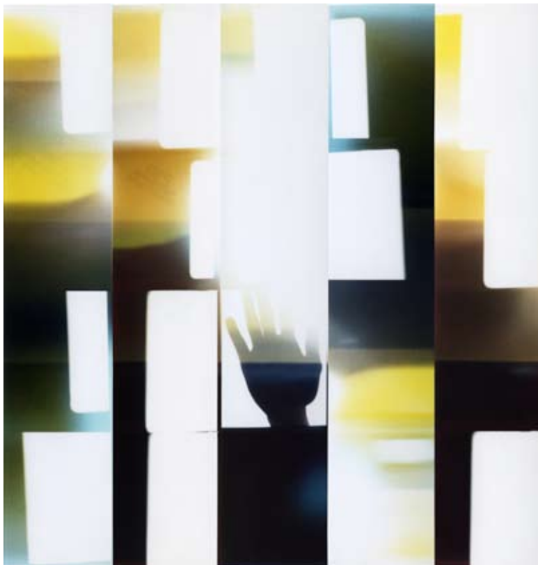
Marc Bellini Scena Obscura Lambda photographic print 890 x 856 mm Edition of 9 London 2002

020 7928 0083 info@bicha.co.uk www.bicha.co.uk