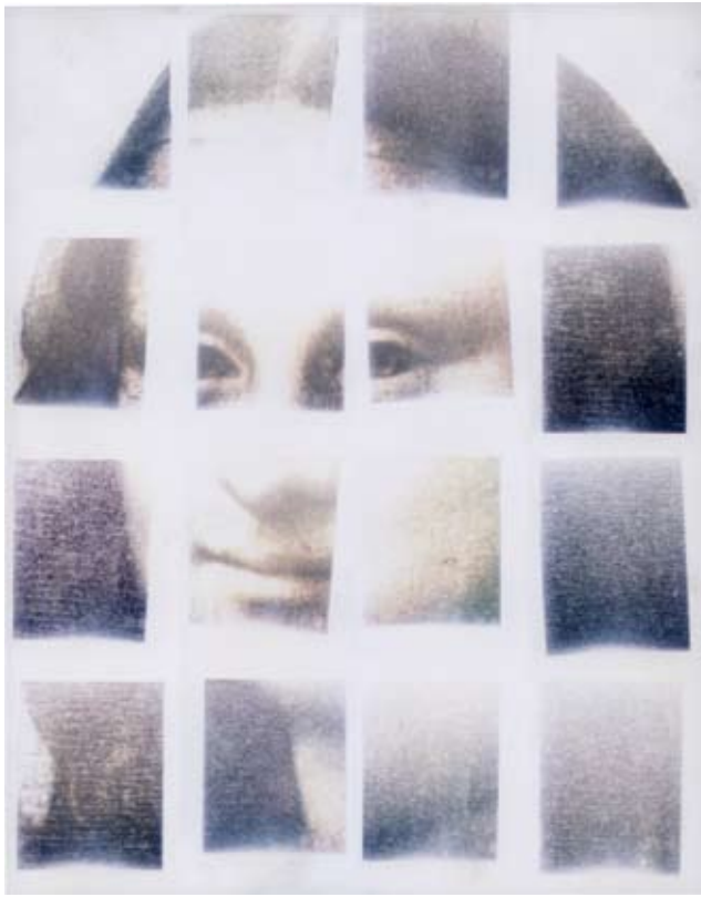
Marc Bellini L'immigrée (The Immigrant) Lambda photographic print 890 x 698 mm Edition of 9 Paris 2000

Bicha Gallery 7 Gabriel's Wharf South Bank London SE1 9PP