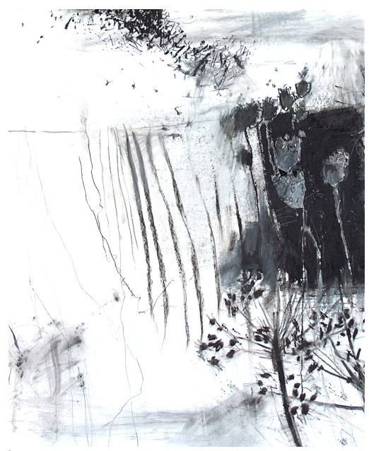
Gathering, charcoal on paper