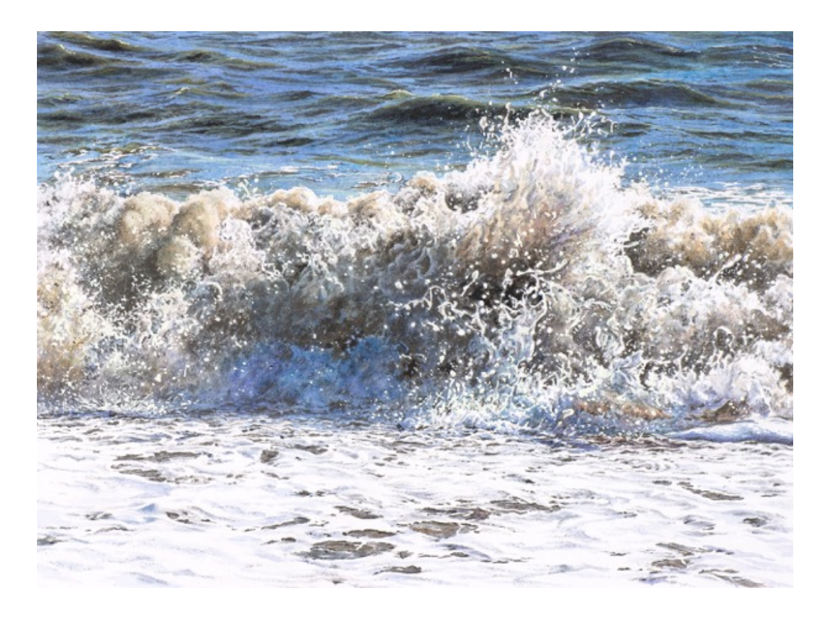
Felicity Flutter Spray and Surf